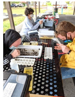
→ rear – chemical testing Foreground – macro identification