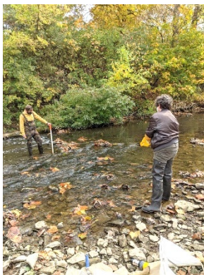
← volunteers estimate stream flow

Studying Natural Resources: ChCWA citizen scientists continued to monitor the water quality of our streams. Usually, spring and fall chemical testing and macro-invertebrate studies are conducted at four sites.